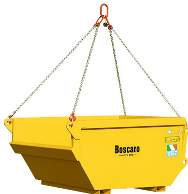
M-150D M-200D M-300D