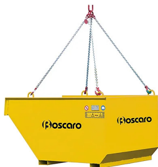
M-50D M-75D M-99D