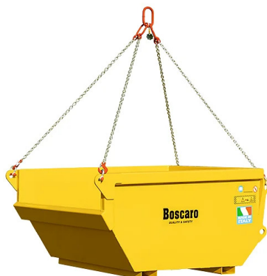
M-150D M-200D M-300D