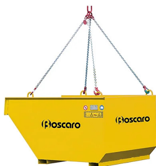
M-50D M-75D M-99D